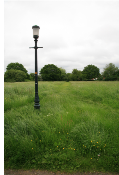
Green Spaces Strategy