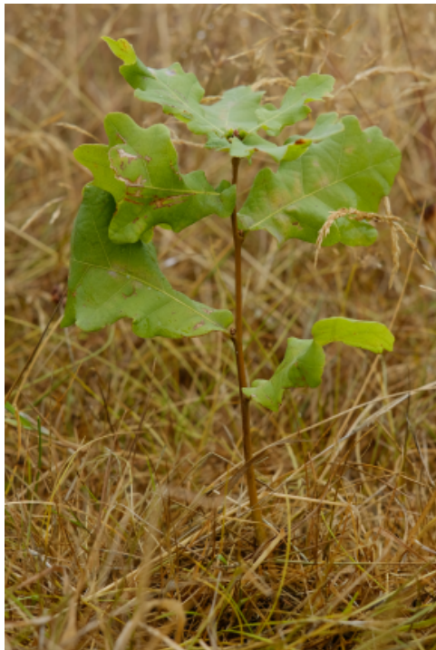
Tree & Woodland Strategy